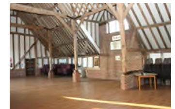
The lovely Barn interior

This increase in popular usage is excellent for the community at large, and the revenue helps to maintain and continually improve the spaces. However, it does bring with it