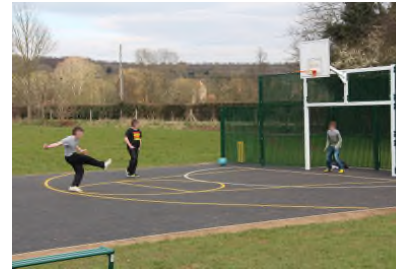
Ball Play Area in Bucknells Meadow

The Recreation Committee manage the two recreation grounds, Goosecroft and Bucknells Meadow, and they support youth initiatives in the village. The grounds are used for both formal sports and casual recreation, and enjoyed by hundreds of people each year.