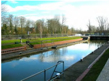
Small sponsored garden at the lock

Here again is our report of Parish Council (PC) activities over the past year.