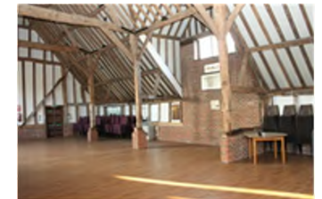
Large hall of the Barn

The Barn is a highly valued venue these days, and becomes busier each year. This is very good financially, as it enables a fantastic facility to exist and satisfy the requirements of a wide range of users, but it also increases our management and administration workload which keeps our staff under pressure. We also need to be mindful of neighbours, and keep any disturbance to a minimum.