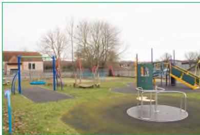
New play equipment at Goosecroft

The Recreation Committee manage the two recreation grounds, Goosecroft and Bucknells Meadow, and they try to encourage youth initiatives in the village. The grounds are used for both formal sports and casual recreation, and enjoyed by hundreds of people each year.