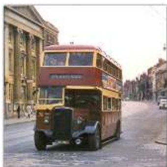
Image: An AEC Regent motorbus No.76 in London Street in the summer of 1962

The current church dates from 1842, but this isn't the first religious building built on this site, so we will also hear about its predecessors, including the earliest, a chapel built about 1089 by Richard de Peasmore, and dedicated to St Peada. We will also learn about the parish and its notable families and people.